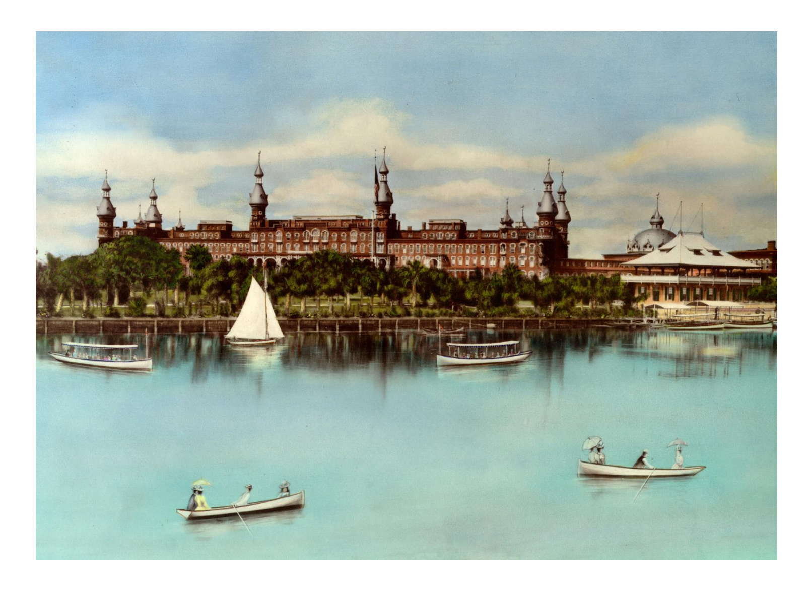
Youth, Family & Educator Activity Booklet

HENRY B. PLANT M U S E U M 1891 TAMPA BAY HOTEL